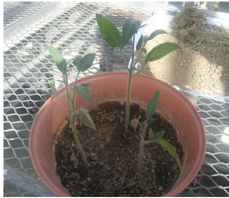
Fig. 2(a). Brandon shore (4 mi)

The study used plant height, leaf diameter, color and stalk diameter to compare the different treatments. Fig. 2 (a, b and C) is an example to show the difference in the rates of growth (after 8 weeks of planting) at 1 mile, 4 mile and control samples for Brandon shore power generating plant. Leaves of the control sample had deeper green color while leaves within 1 mile radius revealed lighter green colors showing some level of stress.