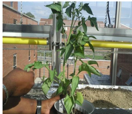
Fig. 2(c). Control sample