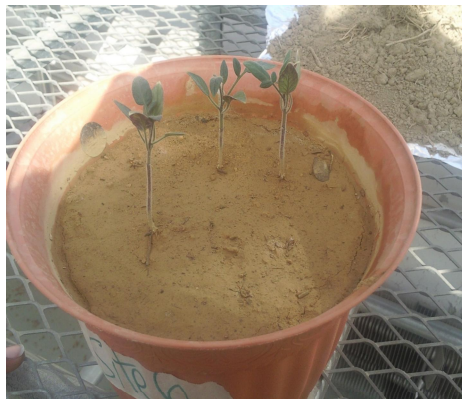
Fig. 2(b). Brandon shore (1 mi)