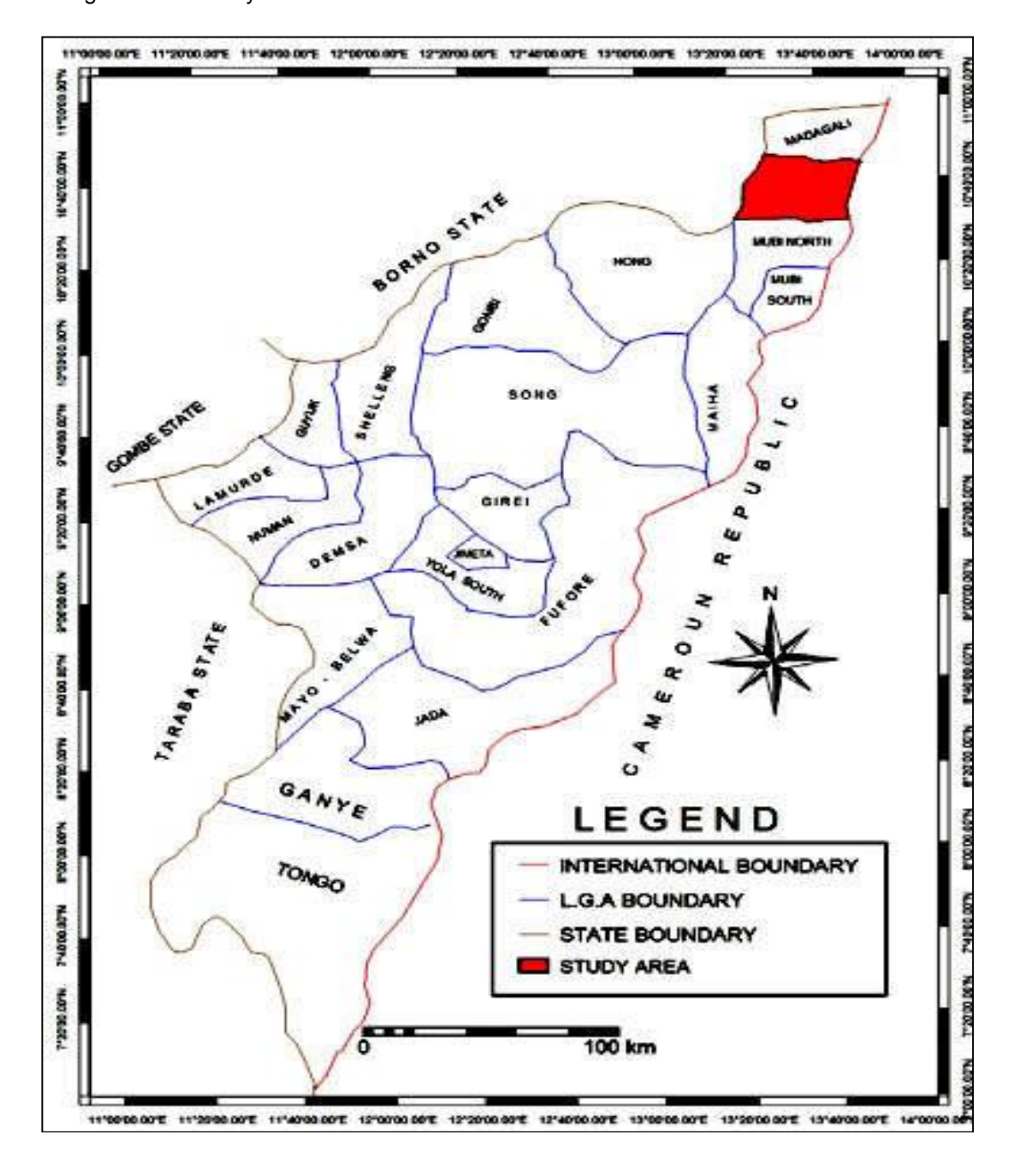
Fig. 1. Map of Adamawa state showing the sampling areas

was absorbed, passes through the flame. The atom of the element in flame absorbed some amount of light which corresponded to its concentration. This was detected on the display unit read as the absorbance. A calibration curve of each element was plotted using the absorbance of the standard against their corresponding concentrations and it was used to determine the concentration of the elements in the samples.