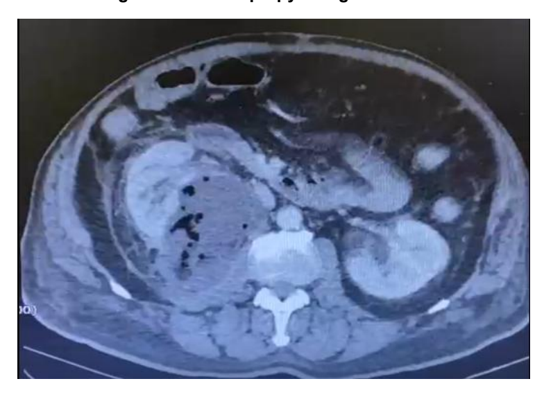
Fig. 2. Right EPN with large perinephric abscess