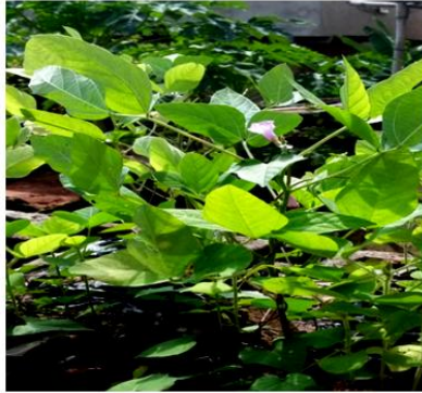
Plate 1. Glycine max plant