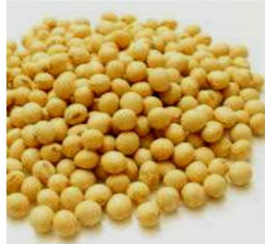
Plate 2. Glycine max seeds