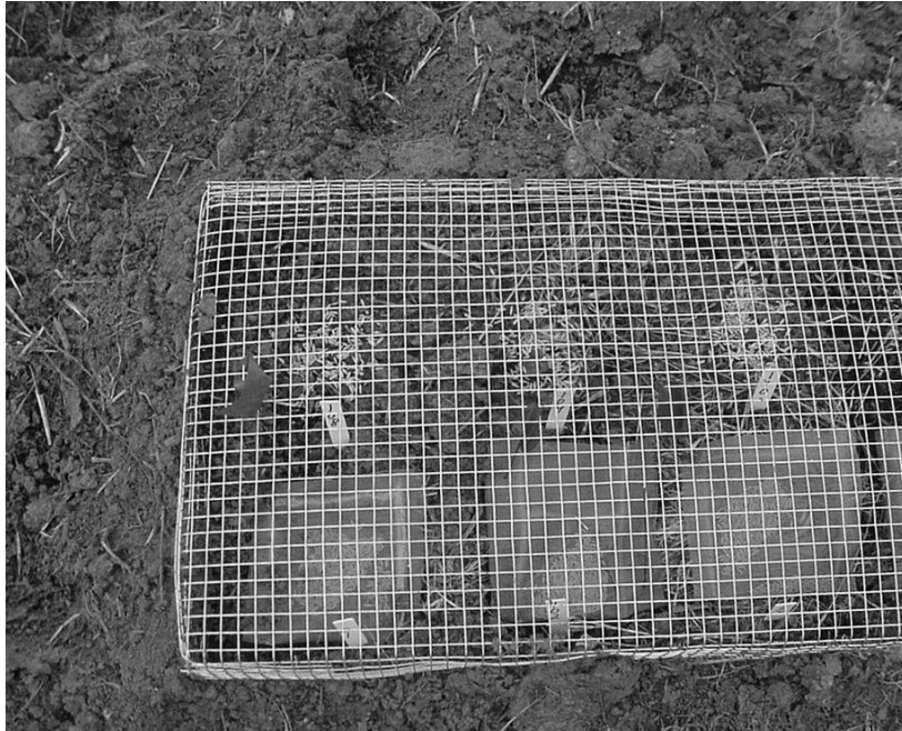
Fig. 1. Cage and seed arrangement for exclusion of vertebrates (top) and vertebrates plus invertebrates (bottom).

methods described above in the cultivar evaluation study, but plots were not treated with crop protection chemicals listed in Table 1. Cocodrie was chosen as its yield comparisons showed great yield potential against other successful rice varieties (Slaton et al., 2000b). Weeds were harvested at physiological maturity from 2.3 m 2 area, dried, and weighed for all weed species in the non-treated and weed-free controls. The weed-free grain yield was compared to the weedy-check. This was not only to survey weed species that were competitive with rice but also to determine emergence, height 115 DAP, heading numbers 133 DAP, grain moisture, and grain yield loss potential in upstate Missouri in the absence of crop protection chemical management.