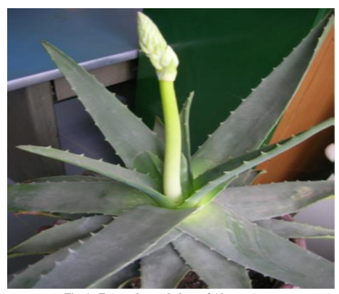
Fig. 1. External morphology of Aloe vera.

The primary computer search strategy and accompanying manual search produced 193 titles (Fig. 3). In the first example, the author chose the articles by reading the titles and abstracts of the retrieved papers, and 127 were omitted because those papers did not fulfill the eligibility requirements. Of those 66 papers, 37 were disqualified as animal studies, in vitro studies, or review articles. The remaining 29 publications that matched the eligibility requirements were thoroughly studied. Of these 29 papers, only 20 clinical trials satisfied our inclusion requirements for our review study. Out of 20 articles, four were on oral lichen planus (OLP) patients, five on oral submucous fibrosis (OSF), and four on recurrent aphthous stomatitis (RAS). Other studies were conducted on patients with burning mouth syndrome (BMS), radiation-induced oral mucositis (RIOM), chemotherapy-induced oral mucositis (CIOM), and xerostomia. Most studies have shown statistically valid evidence of the effectiveness of Aloe vera in the treatment of oral lesions. Data such as author details, study year, study design, study sample, treated oral mucosal condition, Aloe vera formulation, outcomes, complications, and any comments for this study were extracted. The abstract of these clinical trials is tabulated in Table 1.