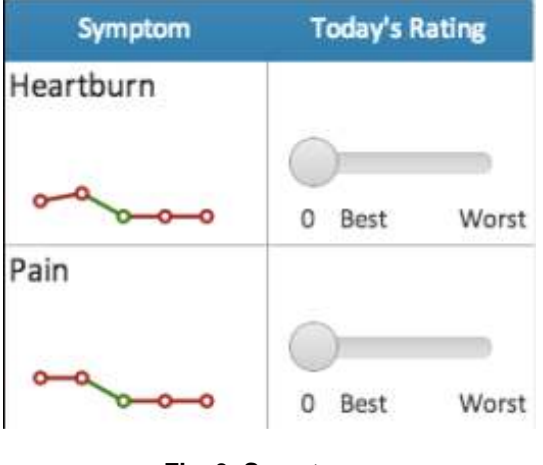
Fig. 3. Symptoms

Concerning item 3, expecting a physician to elicit, or a patient to recall, all relevant recent symptoms are a difficult challenge. However, mobile health applications are ideal for circumventing such challenges around ideal practices due to time limitations. An application can document the majority of symptoms an IBD patient is experiencing and report them to thereby facilitating a deeper physicians, understanding of a patient's condition. Creating a venue for information sharing about symptoms mav prompt conversations and initiate modifications in treatment that allow physicians to address problems in a more expedient manner. A potential system for chronicling symptoms in response to patient feedback that is being used for HealthPROMISE may be observed in Fig. 3.