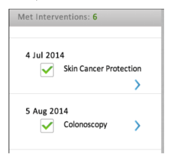
Fig. 4. Monitoring quality indicators

Baars et al. [4] in a study with 1093 IBD patients found that 98% felt it was important to be involved in the decision-making process regarding medical treatment options and goals. In item 4, as patients in the focus group hiahliahted. goals are only inconsistently discussed if at all. While standardizing the goals of treatment may be difficult, the American Gastroenterological Association (AGA) has generated key IBD quality indicator measures that are important to meet for all physicians treating IBD. In HealthPROMISE, the major quality indicators tracked by gastroenterologists treating IBD are included for patients to monitor, update and discuss with their physician (Fig. 4). This may elucidate for patients the rationale behind certain treatments and encourage conversations between patients and physicians on this topic.