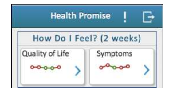
Fig. 2. Quality of life trackers

Schlomerich et al. [16] reported in a 1983 study that 77% of patients with IBD felt insufficiently informed about their disease and would like more information. In part, the solution to this problem identified by the patient in this study in items 1 and 2 above may lie in offering education to IBD patients as part of a mobile health application. Previous studies suggest that patient education improves patient satisfaction [17]. This could include physician-led videos explaining IBD conventional treatments as well as potential alternatives. As per a recommendation from the focus groups, an education section could also connect patients to recent literature in IBD. While the best format to integrate patient education into a mobile health application is still being refined for HealthPROMISE, the patient desire and need for more information is clear.