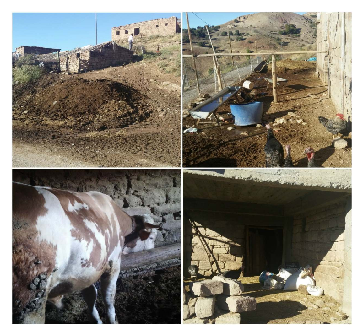
Fig. 2. An example of the random solid and liquid animal wastes causing pollution and hazard for environment, people and animals

present height difference between the structures of the businesses and other neighbor businesses (Fig. 2.). The necessary precautions was not taken in the place selection and positioning of the barns in most of the businesses studied in the region. Most of the barns were built within the settlement areas, generally next to the housings in rural areas. It was determined that the solid and liquid animal wastes have an adverse effect on the environmental health because they are stored in piles in the open around the barn and in the business yard.