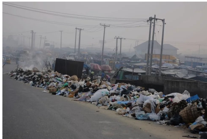
Plate 1. Heaps of waste being burned around Tombia in Yenagoa

A major adverse impact of indiscriminate waste dumping is its attraction of rodents and vector