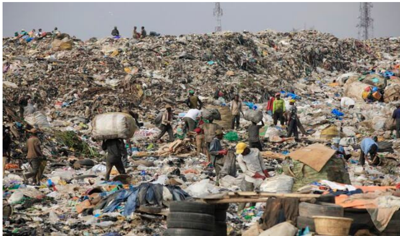
Plate 2. Dumpsite along Amassoma Road, Yenagoa

insects for which it provides food and shelter. Impact on environmental quality takes the form of foul odours and unsightliness. These impacts are not confined merely to the disposal site. On the contrary, they pervade the area surrounding the site and wherever the wastes are generated, spread, or accumulated. Unless an organic waste is appropriately managed, its adverse impact will continue until it has fully decomposed or otherwise stabilized. Uncontrolled or poorly managed intermediate decomposition products can contaminate air, water, and soil resources [13]. Studies have shown that a high percentage of workers who handle refuse, and of individuals who live near or on disposal sites, are infected with gastrointestinal parasites, worms, and related organisms [14]. Although it is certain that vector insects and rodents can transmit various pathogenic agents (amoebic and bacillary