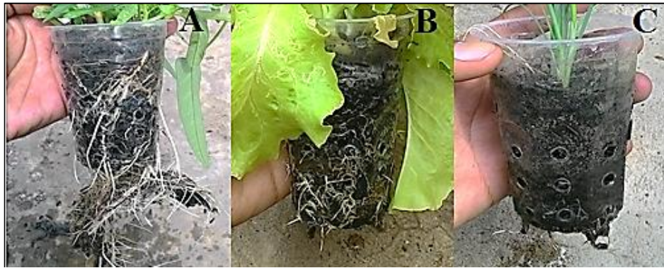
Fig. 2. Plant roots: A (Water spinach), B (Lettuce) and C (Scallions)

The survival rate of Striped catfish seedlings in every treatment were good enough because the survival rate was above 90%. According to SNI [13], good survival rate for Striped catfish cultivation ranges from 80-95%. The death of catfish seedlings in each treatment was thought to be caused by the decrease in water quality, especially because of temperature fluctuations. According to Noerkhaerin [14], an increase or decrease in temperature will result in changes in metabolic rate and energy needs of fish.