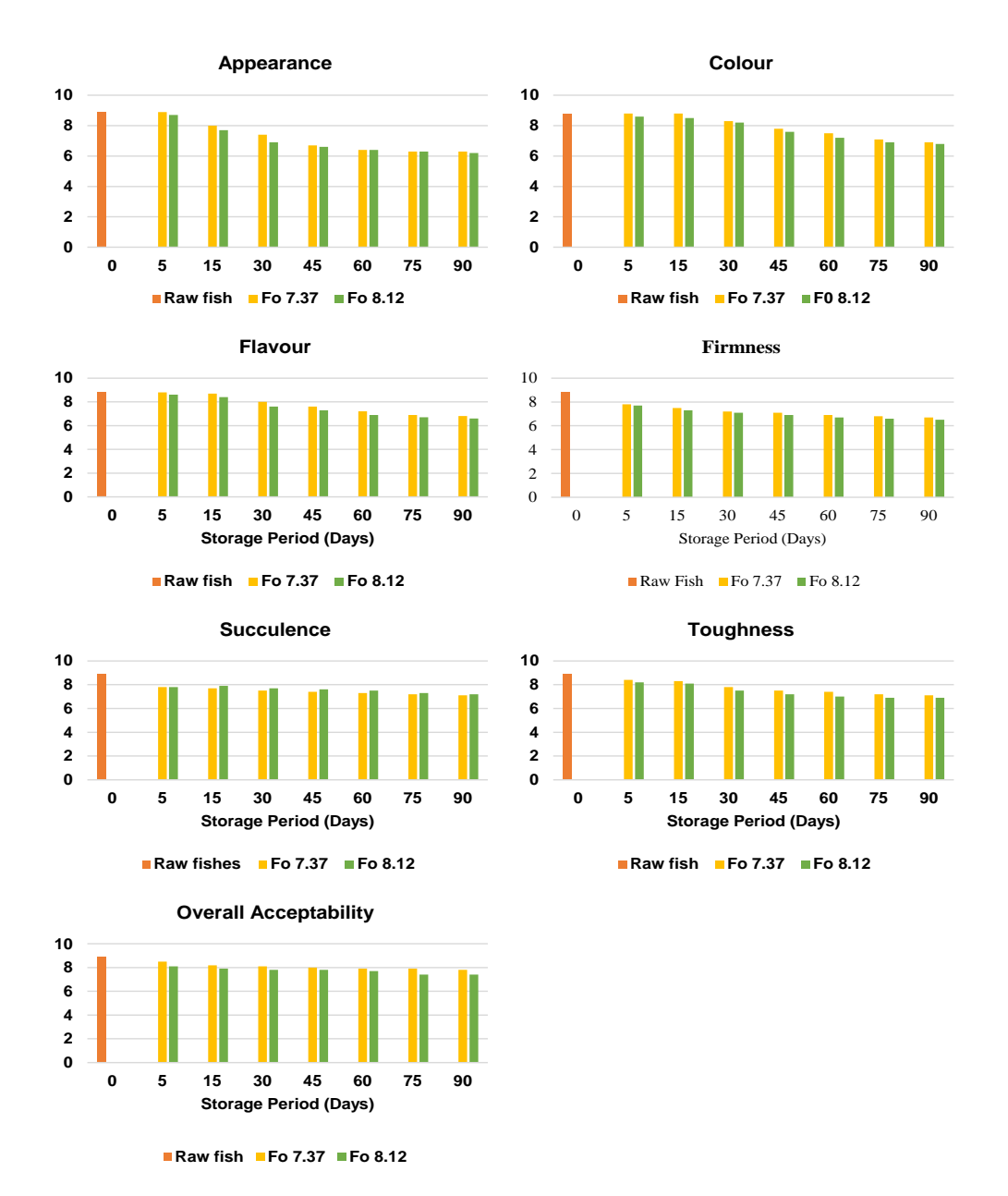
Fig. 3. Sensory Evaluation of fresh and thermally processed Pangasius fillet chunks in masala processed at F_0 7.37 and F_0 8.12 minutes