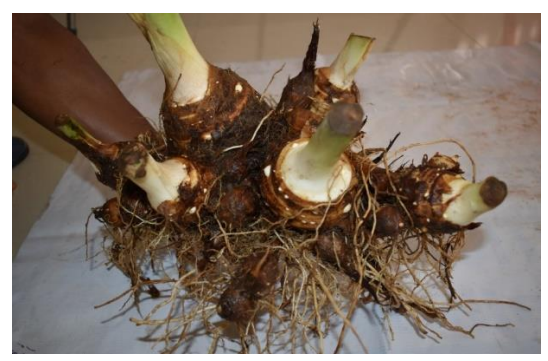
Fig. 2. Daomasar