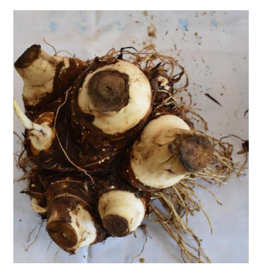
Fig. 5. Tharun gabwi