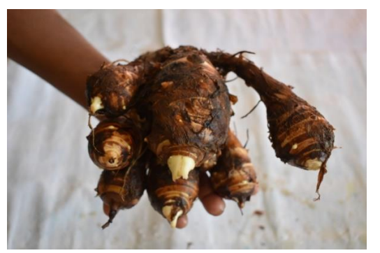
Fig. 1. Abor