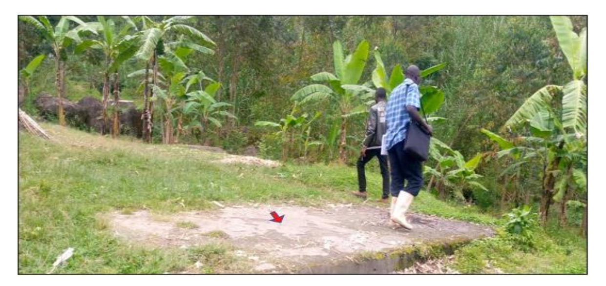
Fig. 2. Representative images of the remains of Nametsi Health Center II (Red Arrow), that was sunk by landslides in Bududa District, Eastern Uganda

Apart from the negative impact of landslides. some cases of positivity were registered upon the community and environment as well. As a consequence of landslide occurrence in parts of Bududa district, some interventions of strategic nature have been undertaken to enhance the way of life of the people. Most of these interventions have been initiated by the government over the past years. Land has been acquired for resettlement and relocation in order to avoid a repeat of the community damages inflicted by the past landslide outbreaks in the same scenes where they manifested. Bulambuli Kiryandongo districts have ultimately and become focal areas of relocating and resettling the Bududa landslide victims. The other has been re-planning the environment to avoid future losses of life and environmental destruction. On this note, one of the participants, a local leader said that, "Following the routine outbreak of devastating landslides at Nametsi and Summe, the government came up with a relocation policy. Many of the victims were relocated for settlement in parts of Kiryandongo and Bulambuli (Bunambutye) for safety reasons environmental protection from further destruction" ((participant H).