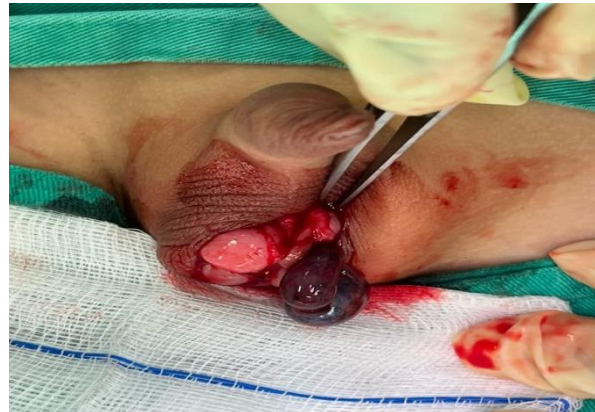
Fig. 3. Intraoperatively showed normal appearance of the right testis with torsion and gangrenous of the left testis