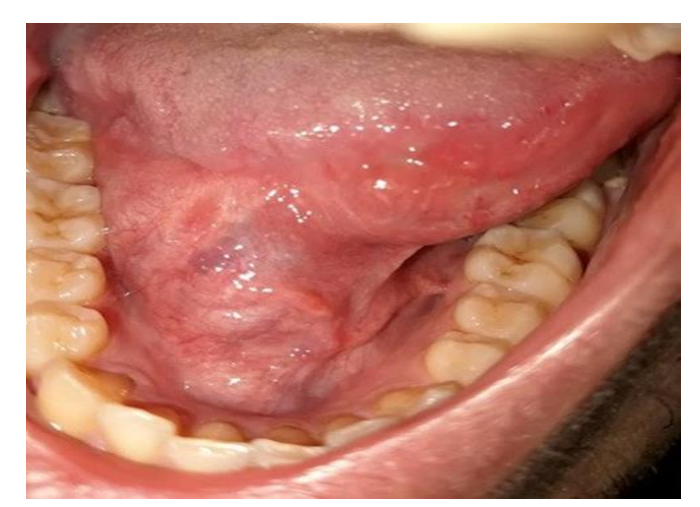
Figure 3) Ranula as a swelling in the floor of the mouth.

Magnetic resonance imaging (MRI) was done using the Tesla 3 technique. MRI reported a slight irregularity on the right border of the tongue and multiple adenopathies in the right submandibular area with the largest nodules measuring 10\times 6 mm. A few days after accurate diagnosis, the patient underwent to Hemi glossectomy and Neck Dissection. On follow up sessions, once every two weeks, no signs of recurrence were evident, but on one year later the patient had a chief complaint of a swelling which was occurred through chewing food and disappeared after the swallowing process. The swelling of the sublingual fold was caused because of the destruction of the ducts of the mandibular salivary glands during the surgical procedure, which was clinically diagnosed as Ranula. (Figure. 3) The patient recovered after three months and returned to healthy diet and speech. After nine months no recurrence of cancer was seen. Follow up will be continued.